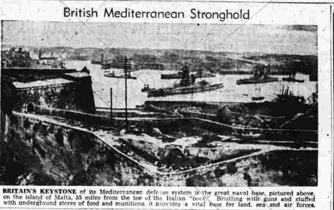
BRITAIN'S KEYSTONE of its Mediterranean defense system is the great naval base, pictured above, on the island of Malta, 35 miles from the toe of the Italian "boot." Bristling with guns and stuffed with underground stores of food and munitions, it provides a vital base for land, sea and air forces.

WOULD-TAX BACHELORS UNTIL ALL MARRY Dover, Del. (AP)—State Rep. Thomas A. Kellum wants to tax bachelors who have passed their 30th birthdays. His bill proposes a $100 annual tax on bachelors between 30 and 35, $150 for those between 35 and 40, and $200 for all over 40. "There would be no necessity for further increases," he said, "because by this time all bachelors would undoubtedly have decided it was cheaper to marry." DETERMINED BURGLAR DOESN'T MIND TEAR GAS Stout City, Ia. (AP)—The burglar who looted the safe at the American Auto Parts Company of $75 had determination. In smashing the "dial" of the strongbox, the burglar released a tube of tear gas. He connected one of the firm's electric fans and drove the fumes away as he continued his robbery. Mayor William H. Felker asserted recently as his "battle to oust married women city employes continued. The mayor said "no threat of loss of votes" would deter him and he added: "let the women organize as political pressure groups if they see fit—I am ready." Mayor Felker has demanded that all married women in the city's employ submit their registrations within three months or "list their reasons why." None so far has indicated any willingness to accede to his demands.